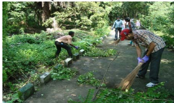
Conducted Swachhata Abhiyan as per the guidelines of HQ on 2nd October, 2014.

Conducted Bharat Swachhata Abhiyan as per the guidelines of HQ on 2nd October, 2014.