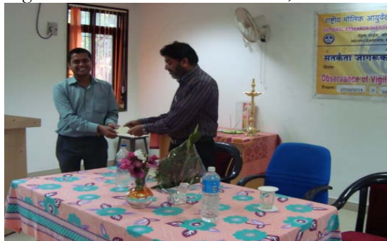
Prize distribution during celebration of Vigilance Awareness Week 27th October to 1st November, 2014

Organized Vigilance Awareness Week in the Institute during 27th October to 1st November, 2014