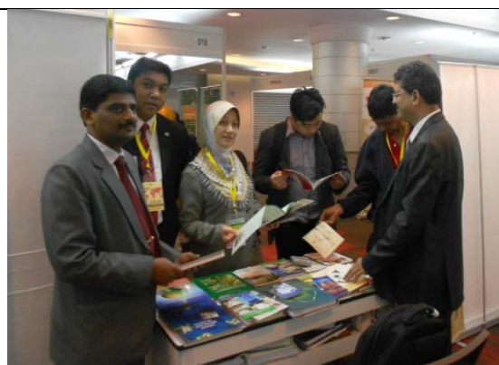
A view of pavilion of Ministry of AYUSH Govt. of India at Kuala Lumpur, Malaysia.