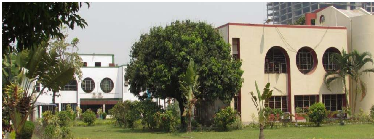
View of NRIADD premises, Kolkata

Background and mandate of the Institute: This institute was established in the year 1972 as Regional Research Institute (Ay) and shifted to its own building at CN Block, Sector- V, Salt Lake City, Kolkata in the year 1997. The 3 acres land was provided by the Government of West Bengal free of cost. This Institute was upgraded as Central Research Institute (Ay.) in the year 1999. Again it was upgraded as National Research Institute of Ayurvedic Drug Development in the year 2009. This Institute has basic facilities for research in literature, drug and clinical trial in Ayurveda and allied disciplines. Different departments such as Hospital (IPD & OPD), Pathology & Bio-chemistry, Pharmacognosy, Chemistry, Pharmacology, Pharmacy etc. are major component of this Institute. The institute is functioning on focused mandates like 1. Development of safe, effective and affordable Ayurvedic drugs. 2. Development of standards for identification, collection and storage of raw materials. 3. Development of SOP for various classical and investigational new drugs (IND) etc.