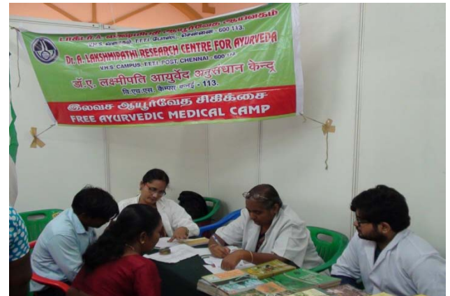
Free Medical Ayurveda camp on 26-29 September 2014 at TIRUVALLURU- Tamilnadu..